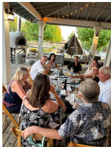
Make mine a Margarita, on the rocks, no salt!!