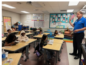
The longest word in the world!